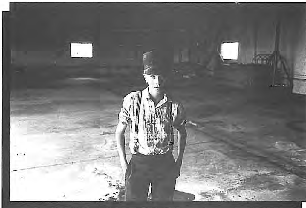
"Hutterite Boy", black and white photograph by George Webber